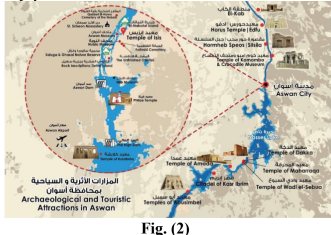
Detailed map for Aswan illustrates the rich legacy of the city's cultural properties (Show & Nicholson, 1905, p. 42)

history of Egypt from Pharaonic, Graeco-Roman, and Byzantine (Coptic), to the Islamic and Modern Era (Morkot, 200; Shaw & Nicholson, 1995). These diverse phases of history produced a rich legacy with priceless monuments, i.e., temples, tombs, obelisks, Nilometers, historic settlements, a wealth of intangible cultural manifestations, and much more authentic traits making the city one of the main tourist destinations in Egypt that pulled with elements of destination attractiveness including natural, cultural, and historical factors among other pull factors (Figure. 2). These elements along with the good weather conditions and the city's tranquility are very notable reasons for the seniors to go on holiday to Aswan and enjoy rest and calm.