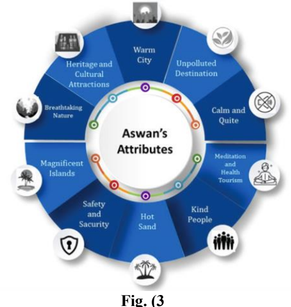
Aswan's Attributes as a Grey Tourism Destination (as reported by the interview respondents)

gives the city a unique potential to become an accessible tourism destination for the Grey Tourism market (Figure 3), yet the pull factors of an age-friendly destination such as barrier-free services and facilities are still untapped. Essential factors still need to be considered to improve accessibility levels and the enabling environment, most importantly, the government's capacity to support tourism infrastructure and services that cater to senior tourists. To this end, significant measures are suggested for advancing and developing the gray tourism market in Aswan in compliance with the accessible tourism chain of UNWTO.