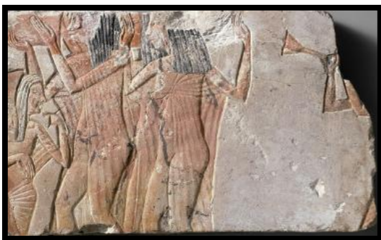
dancers and musicians. (The Met, 2024)