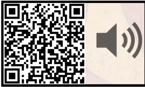
Fig. 5: The trumpets performance from the 1939 broadcast. (Lebée, 2020).

James Tapper improvisation created "ear-splitting discord" since the trumpets were not designed to play more than one note at a time. The resulting sound offered a unique and haunting auditory experience (Robert, 2019).