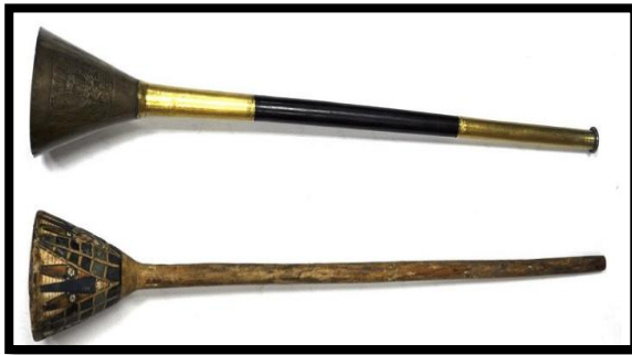
Fig. 3: The copper trumpet of Tutankhamun and its wooden protective core. (Fox, 2020).

The copper trumpet is made from copper alloy; however, some sources suggest it may be bronze (Fox, 2020). It features a gold overlay at both ends of the