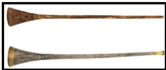
Fig. 2: The silver trumpet of Tutankhamun and its wooden protective core. (Fox, 2020).

Both trumpets share a common construction of a ring, tube and bell. They are relatively lengthy; the bronze trumpet is about 50 cm long, while the silver trumpet is around 58 cm (Fox, 2020). The maximum diameters of the bells are 8.4 cm and 8.2 cm. Unlike modern brass instruments, these trumpets lacked